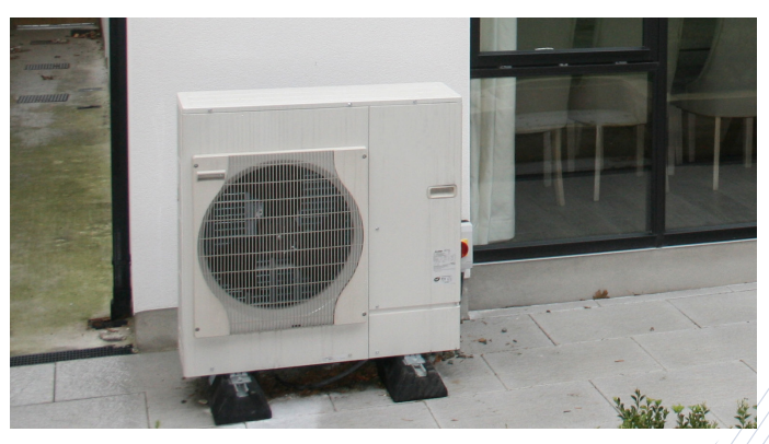
Figure 2: Air Source Heat Pump Outdoor Unit

Ground Source and Water Source: Ground source and water source heat pump systems are less common than air source units. A ground source heat pump system, also known as a geothermal heat pump system, uses the earth as a source of renewable heat. Heat is drawn from the ground through collector pipework and transferred to the heat pump. The ground collector can be laid out horizontally at a shallow depth below the surface or else vertically to a greater depth.